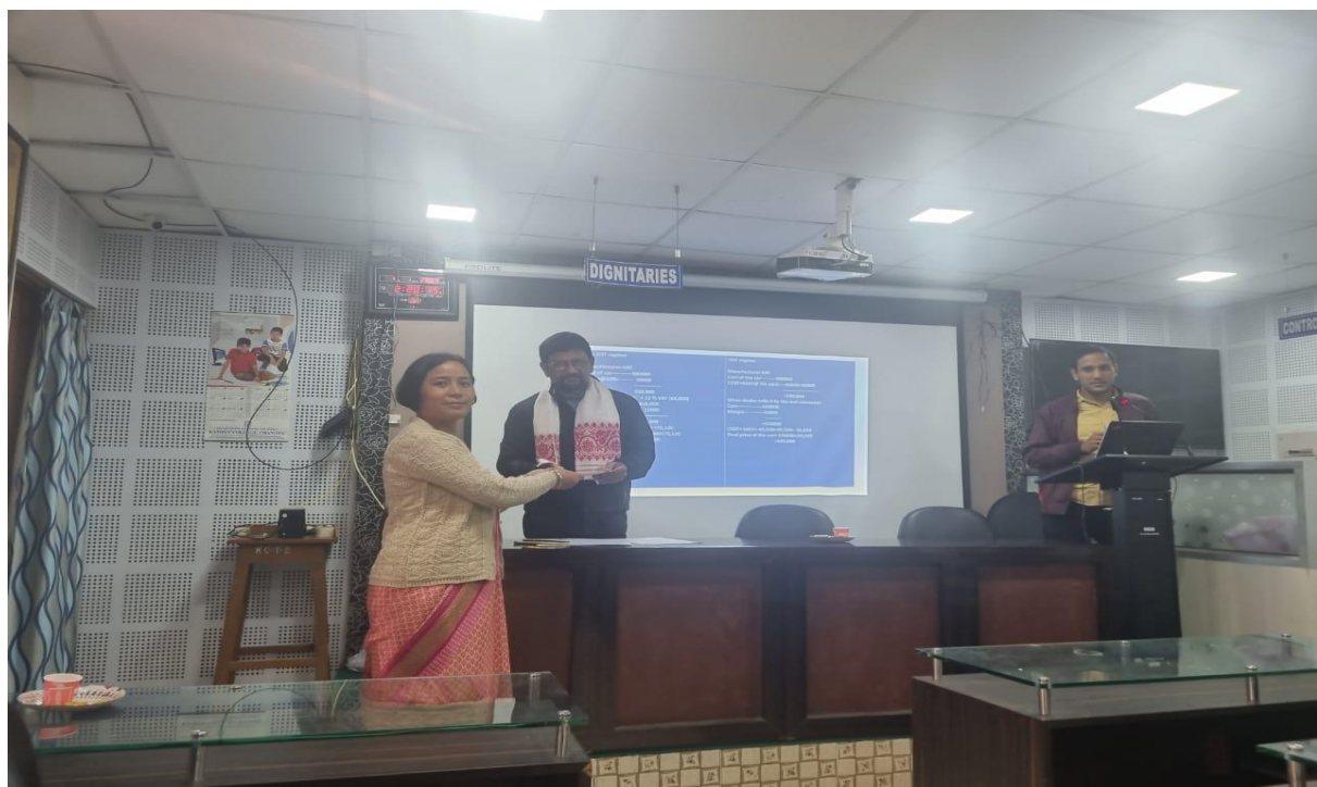
Distribution of Certificates