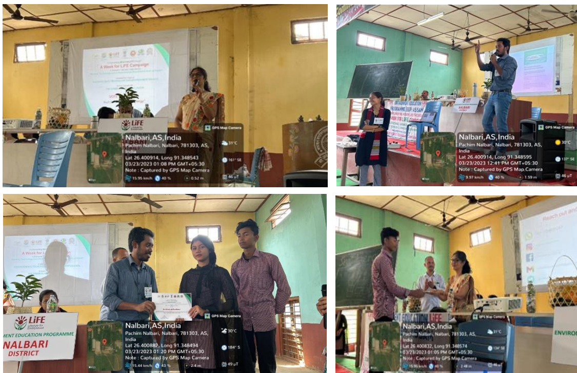
Figure 3: Interaction with students and distribution of prizes.