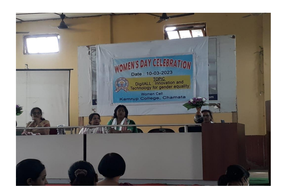
Distinguished speakers on dais on account of Women's Day Celebration at KCC.