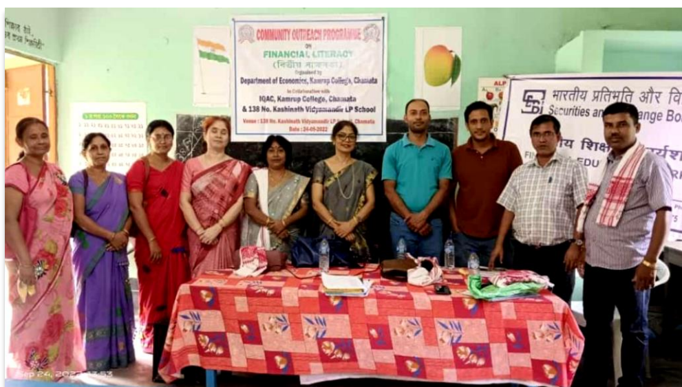
Faculties of Kamrup College and 138 No. Kashinath Vidyamandir LP School, with Vice-Principal, Kamrup College and the invited resource person