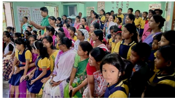
Students of 138 No. Kashinath Vidyamandir LP School, along with their guardians