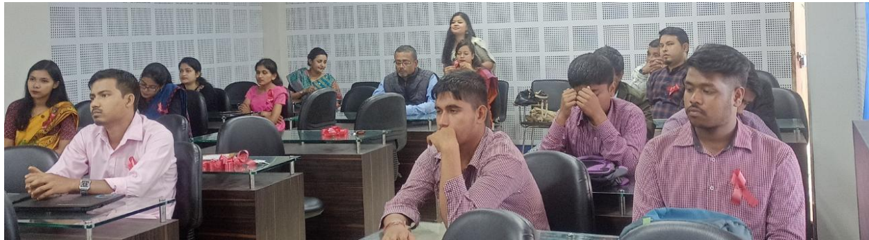
Figure 4: Participants during the talk