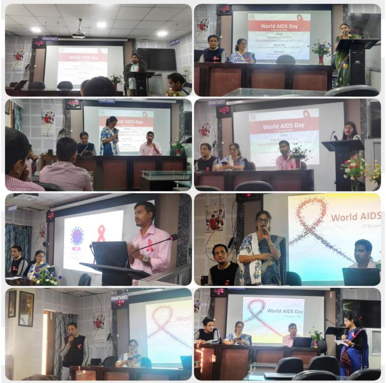
Figure 3: Few glimpses of the event