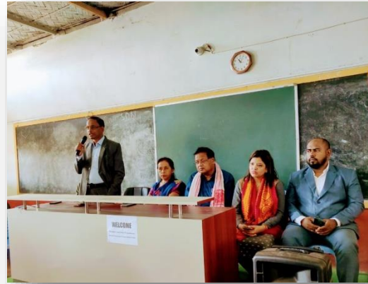
Figure 2: Various Moments of the event