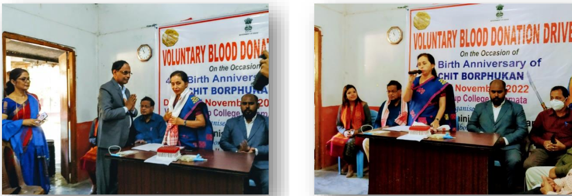
Figure 1: Felicitation of Deputy Commissioner by the Principal (Kamrup College) and her introductory speech